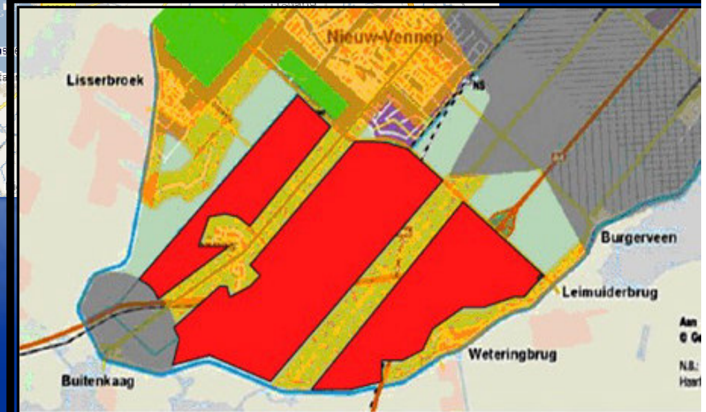
potentiële mogelijkheden windturbines binnen zoekgebied (lichtrood)