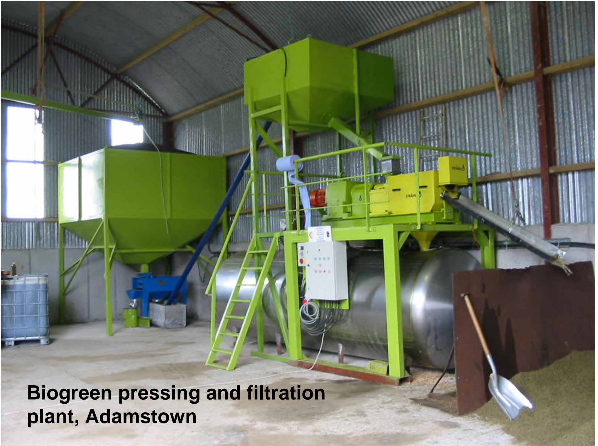
Biogreen pressing and filtration plant, Adamstown